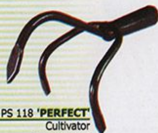
PS 118 'PERFECT' Cultivator Three Prong