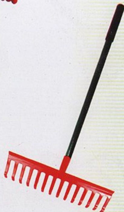
PS 111 'PERFECT' Garden Rake Available sizes 8, 10, 12, 14, 16 Teeth