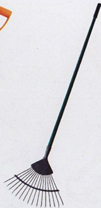
PS 108 'PERFECT' Leaf Rake 16T