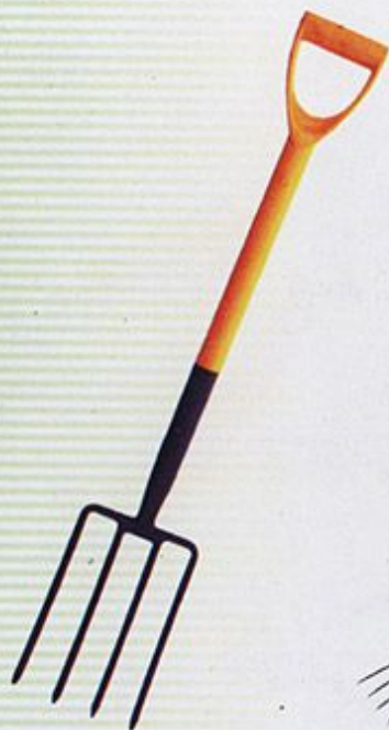
PS 107 'PERFECT' Digging Fork with PVC Handle