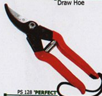
PS 128 'PERFECT' Pruning Secateur