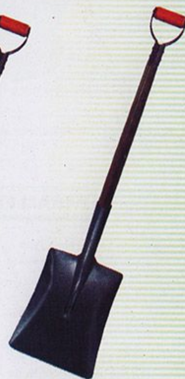
PS 106 ' PERFECT ' Square Shovel with Wooden Handle Steel Hand Grip