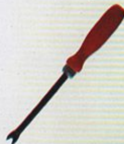
PS 116 'PERFECT' Weeder