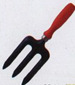
PS 114 'PERFECT' Hand Fork