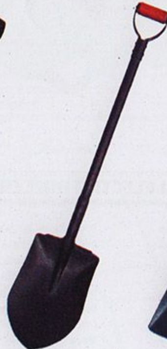
PS 105 ' PERFECT ' Round Shovel with Tubular Handle, Steel Hand Grip