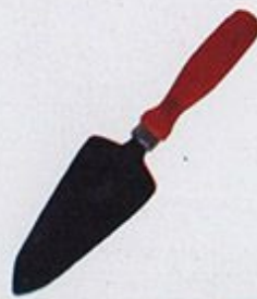
PS 113 'PERFECT' Transplanter