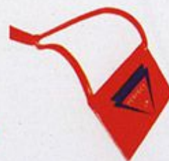
PS 126 'PERFECT' Draw Hoe