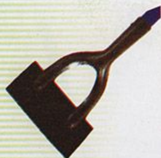
PS 117 'PERFECT' Dutch Hoe