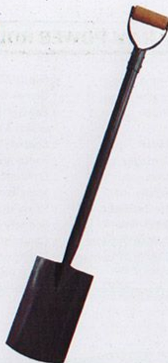
PS 103 ' PERFECT ' Digging Spade with Tubular Handle