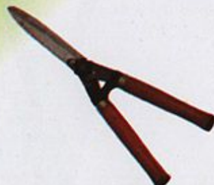
PS 124 'PERFECT' Hedge Shear