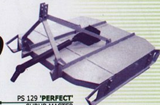
PS 129 'PERFECT' SHRUB MASTER