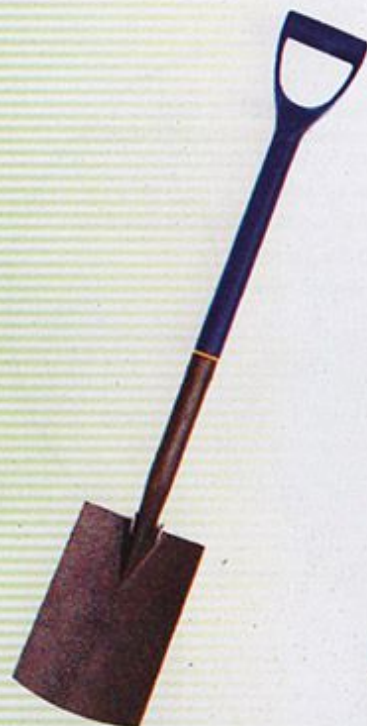
PS 101 ' PERFECT ' Digging Spade with PVC Handle