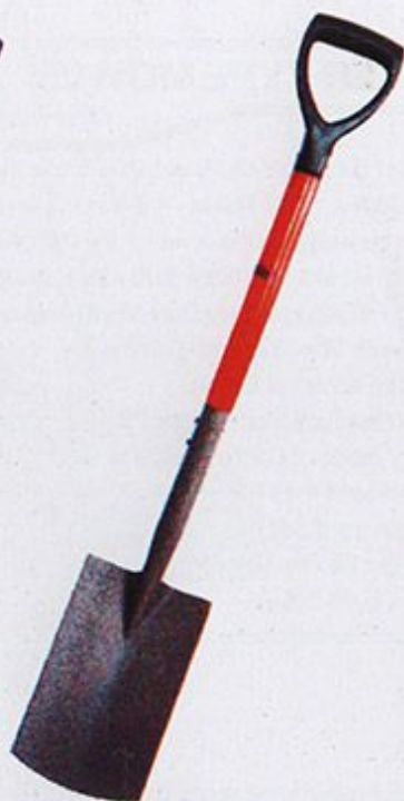
PS 102 ' PERFECT ' Digging Spade with Wooden Handle