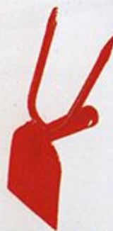
PS 120 'PERFECT' Hoe Fork Two Prong