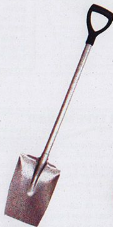
PS 104 ' PERFECT ' Square Shovels with Tubular Handle, Plastic 'D' Grip