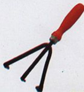
PS 115 'PERFECT' Hand Cultivator