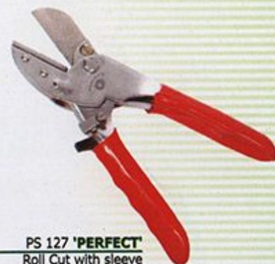
PS 127 'PERFECT' Roll Cut with sleeve