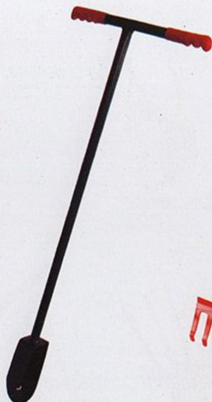
PS 110 'PERFECT' Earth Drill 3"