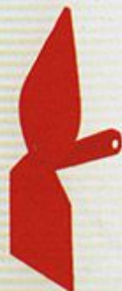
PS 119 'PERFECT' Hoe Trowel