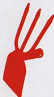
PS 121 'PERFECT' Hoe Fork Three Prong