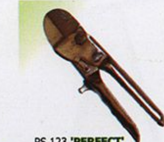
PS 123 'PERFECT' Roll Cut