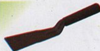
PS 122 'PERFECT' Khurpa Size 1, 2, 3 Inches