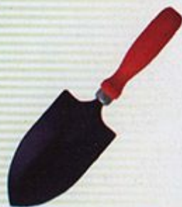
PS 112 'PERFECT' Hand Trowel