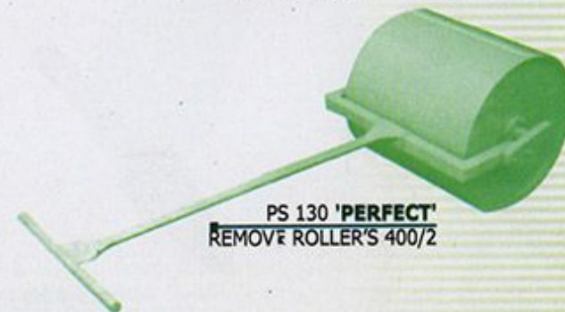
PS 130 'PERFECT' REMOVE ROLLER'S 400/2