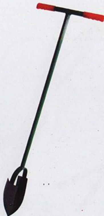
PS 109 'PERFECT' Earth Drill 6"