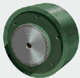
BrakeDrum Resilient Coupling