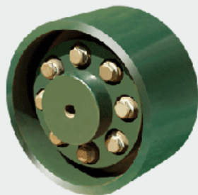
BrakeDrum Pin Bush Coupling