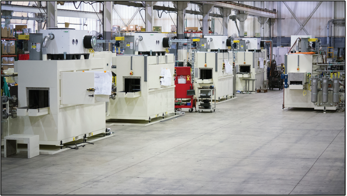
Horizontal “S” Enclosure located on top of parts spray washers.