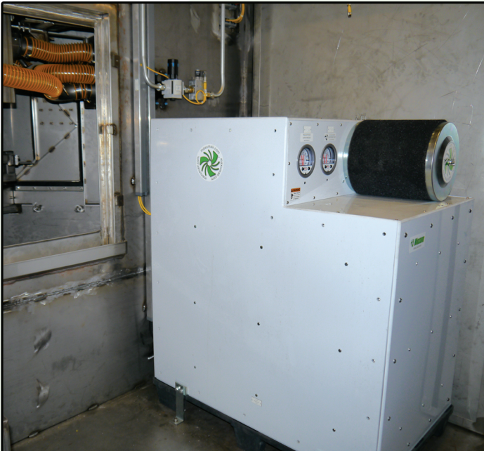
Vertical Enclosure next to wash chamber