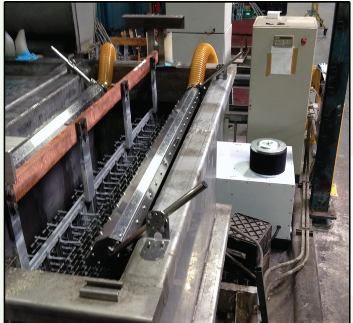
Horizontal “T” Enclosure next to anodizing line