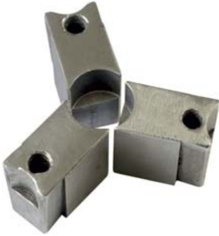
Taper Locking Tips Medium Diameter