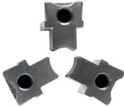
VSD Tip Set Small Diameter