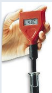
Economical pH Testers With Replaceable Electrode