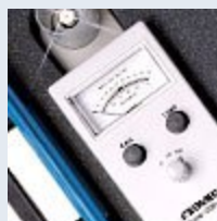
Analog Resistivity and Conductivity Meters