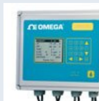
Complete Water Treatment Controller Systems