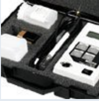
Portable Conductivity Meter