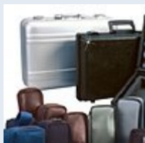
Protective Carrying Cases