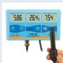
6-in-1 Multi-Function Water Analysis Meter