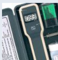
pH, ORP, Conductivity and TDS Testers