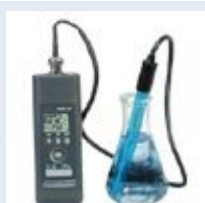
Handheld pH/mV Meter with RS232 Communications and Software