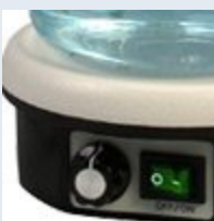
Electrode Holder and Magnetic Stirrer