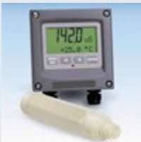
2-WIRE ISOLATED CONDUCTIVITY TRANSMITTER SYSTEM