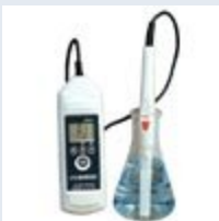
Handheld Salinity Meter