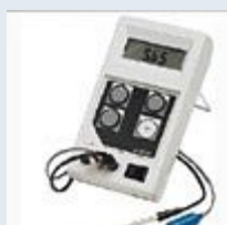
Portable pH/mV Meters with ATC