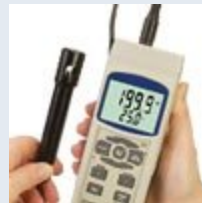
Conductivity, TDS and Salt Meter with Real Time SD Card Data Logger