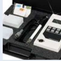
Portable Conductivity/Resistivity/TDS/Salin ity Meter