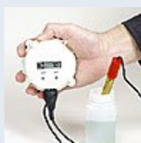
Water-Resistant pH Indicator with Visual Alarm