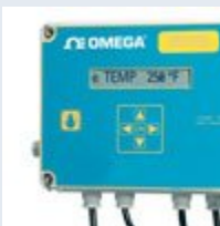
Water Treatment Controllers