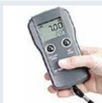
Measure pH of Soil Directly with a Special pH Electrode