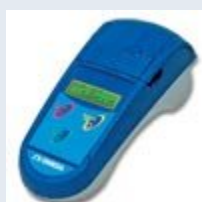
pH/mV Benchtop Meter