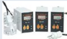
Mini Panel-Mount Conductivity and TDS Controllers