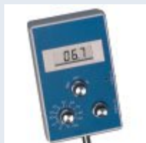
pH Meter and Calibration Kits Digital Handheld pH Meters