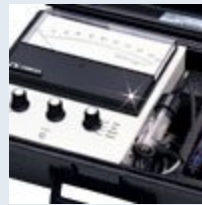
5-range Portable Analog Conductivity Meters