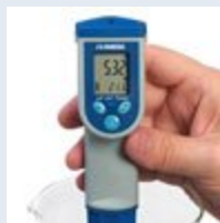
pH and Conductivity Testers