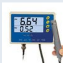
5-in-1 Multi-Parameter Water Quality Meter