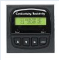
Dual Channel Conductivity/Resistivity Controller