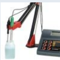
pH Measurement Electrode Basics Technical reference