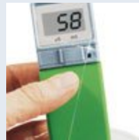
Economical Pocket Conductivity Testers