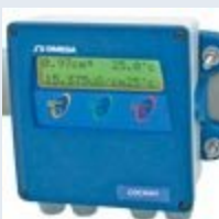
Conductivity or Resistivity Controller