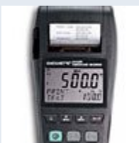
Temperature RS-232 Graphic Recorder