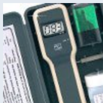
pH, ORP, Conductivity and TDS Testers