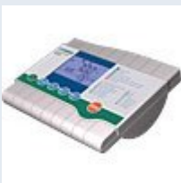
pH Benchtop Meter with RS232 Communications