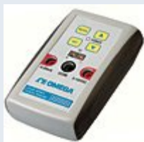
Universal Verbalizer Process-Signal-to-Speech Converter