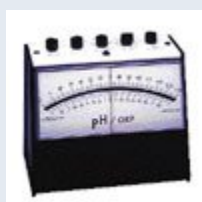
Compact pH/ORP Analog Single Limit Controller