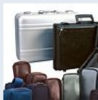
Protective Carrying Cases