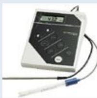
Benchtop pH Meters Ion Analyzers With RS-232C Interface