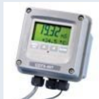
Toroidal Conductivity System