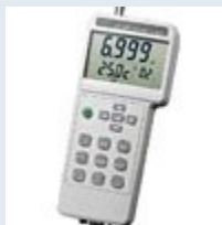
Portable pH/mV/ORP and Temperature Meter with RS-232