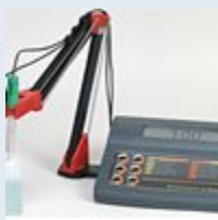
pH/mV/Temperature Benchtop with RS-232 Capability