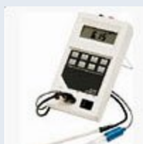
Splashproof Portable pH/mV Measurement Kits