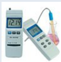
Economical pH Meter or pH/mv Meter