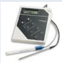
Microprocessor-based Benchtop pH/mV Meters