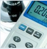
Economical Conductivity Meter and Conductivity/TDS Meter with RS232