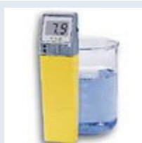
Pocket pH Testers with Replaceable Electrodes