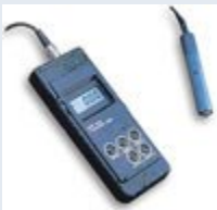
Water-Resistant Conductivity Meters