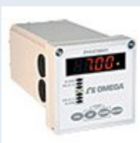
pH, ORP and Conductivity Controller and Transmitter