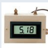
Compact Mini Digital pH Meter With Optional Mounting Bracket