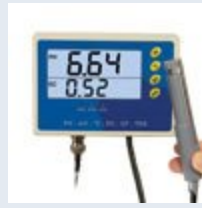
5-in-1 Multi-Parameter Water Quality Meter