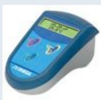
Benchtop pH, mV, ISE Meter