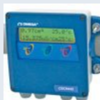
Toroidal Conductivity or Concentration Analyzer