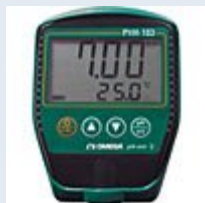
Portable pH/mV Temperature Meter