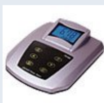
pH Benchtop Meter with RS232 Communications