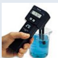
Dual pH/conductivity the Most Popular meters