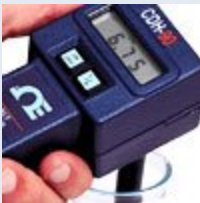
Handheld Resistivity and Salt Meters