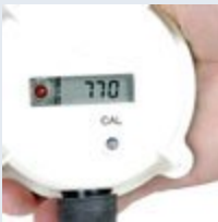
Water-Resistant Conductivity/TDS Meters with Visual Alarm