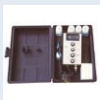
HANDHELD PORTABLE pH/mV METER