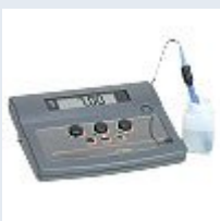
pH/mV Bench Meter