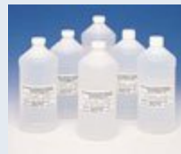
Conductivity Calibration Solutions