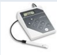
Benchtop Microprocessor- Based Conductivity/Resistivity/TDS Meters