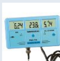
6-in-1 Multi-Function Water Analysis Meter