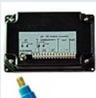
pH and Conductivity Transmitter