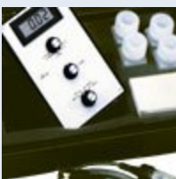
HANDHELD PORTABLE CONDUCTIVITY METER