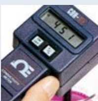
Four-range Portable Digital Conductivity Meters