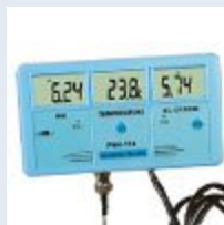
6-in-1 Multi-Function Water Analysis Meter