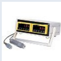
Single or Dual Input Laboratory or Industrial Benchtop Controllers for pH or ORP