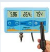
6-in-1 Multi-Function Water Analysis Meter