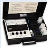
Portable pH Meters