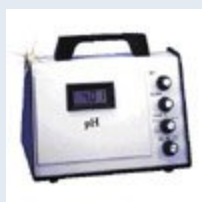
pH/MV DIGITAL FIELD OR BENCHTOP SERIES METER