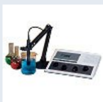
pH Buffers and Indicator Papers