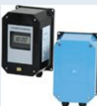
Conductivity Transmitters Using 4-Ring Technology