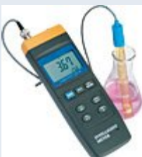
Economical pH/mV/ORP/Conductivity/TDS Meter with RS232 Output