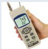
pH/ORP Meter with Real- Time Data Logger