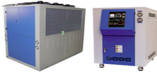
Air Cooled Chiller