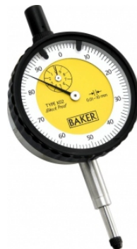
PLUNGER DIAL GAUGE