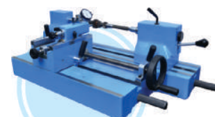
GEAR SHAFT MEASURING MACHINE