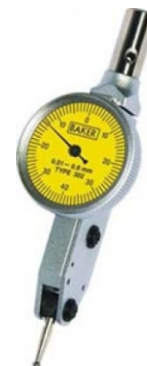
LEVER TYPE DIAL GAUGE