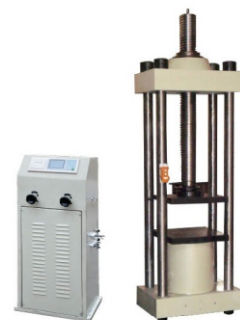
COMPRESSION TESTING MACHINE