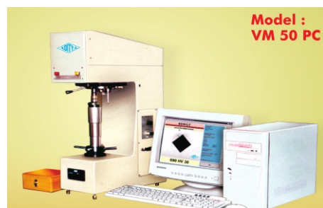
VICKERS HARDNESS TESTER