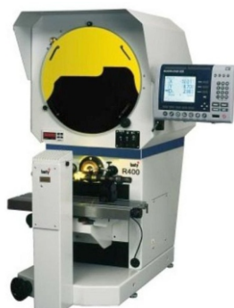
HORIZONTAL PROFILE PROJECTOR