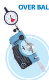
OVER BALL DIAMETER SNAP GAUGE