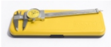
DIAL TYPE VERNIER CALIPER