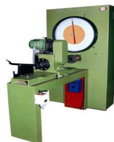
TORSION TESTING MACHINE