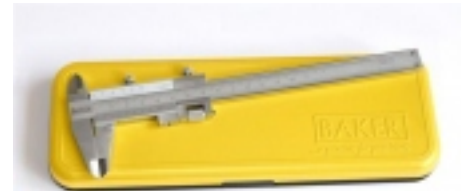
CONVENTIONAL VERNIER CALIPER