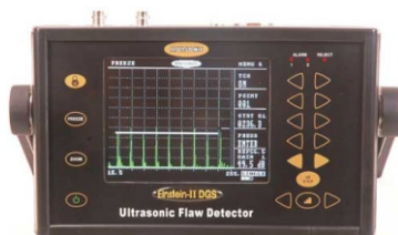
ULTRASONIC TESTING MACHINE