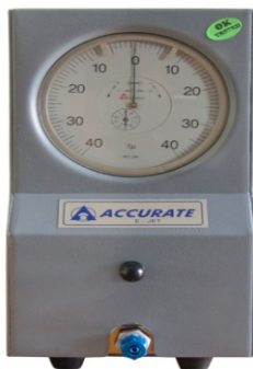
'E' TYPE AIR GAUGE