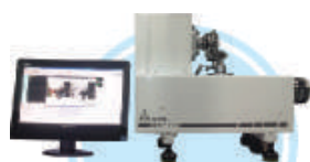
CNC/ AUTOMATIC BEVEL GEAR ROLL TESTER ( MODEL GRT B100)