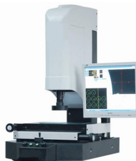
VIDEO MEASURING MACHINE