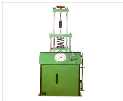
SPRING TESTING MACHINE