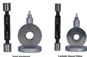
AIR RING GAUGES