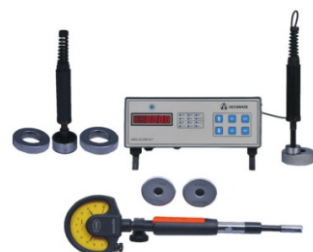
CONTACT TYPE GAUGES