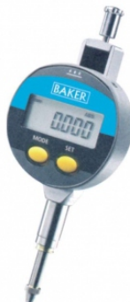
DIGITAL DIAL GAUGE