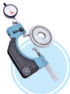
SPAN SNAP GAUGE