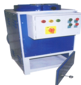
SAMPLE PREPARATION MACHINE