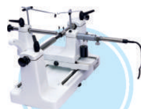
FLOATING CARRIAGE MICROMETER