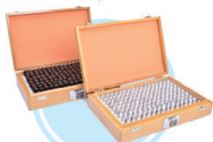
MEASURING PIN SET