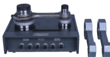
CONNECTING ROD PNEUMATIC FIXTURE