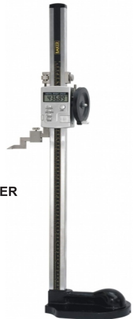
DIGITAL HEIGHT GAUGE