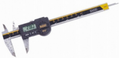
DIGITAL VERNIER CALIPER