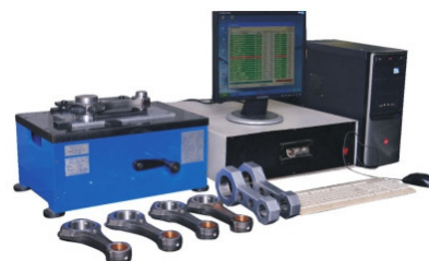
CONNECTING ROD CONTACT TYPE MEASUREMENT