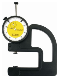
DIAL THICKNESS GAUGE