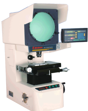
VERTICAL PROFILE PROJECTOR