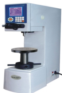
BRINELL HARDNESS TESTER