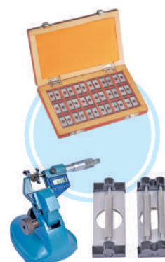
THREE WIRE SET