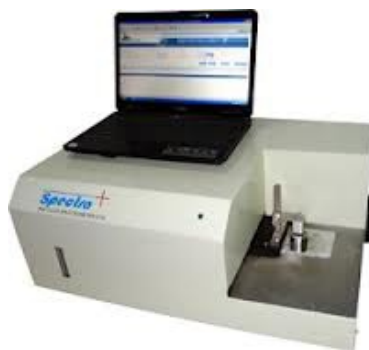
OPTICAL EMISSION SPECTROMETER