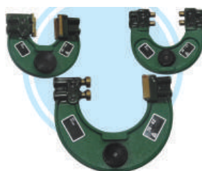
ADJUSTABLE SNAP GAUGE