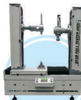
CNC UNIVERSAL GEAR ROLL TESTER