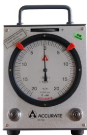
'C' TYPE AIR GAUGE