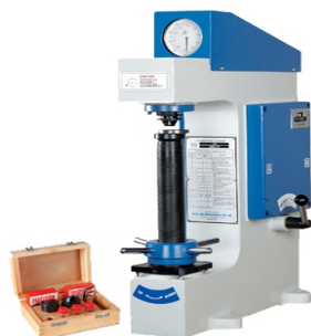
ROCKWELL HARDNESS TESTER