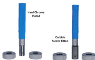
AIR PLUG GAUGES