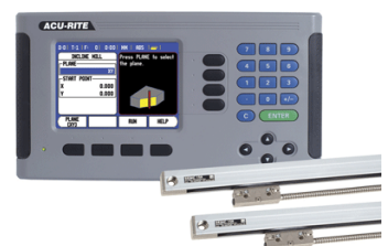
DIGITAL READOUT SYSTEM