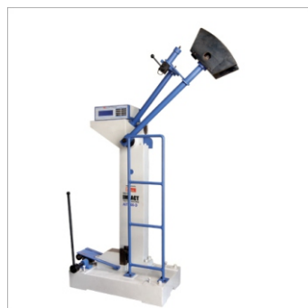
IMPACT TESTING MACHINE