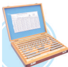
SLIP GAUGE SET