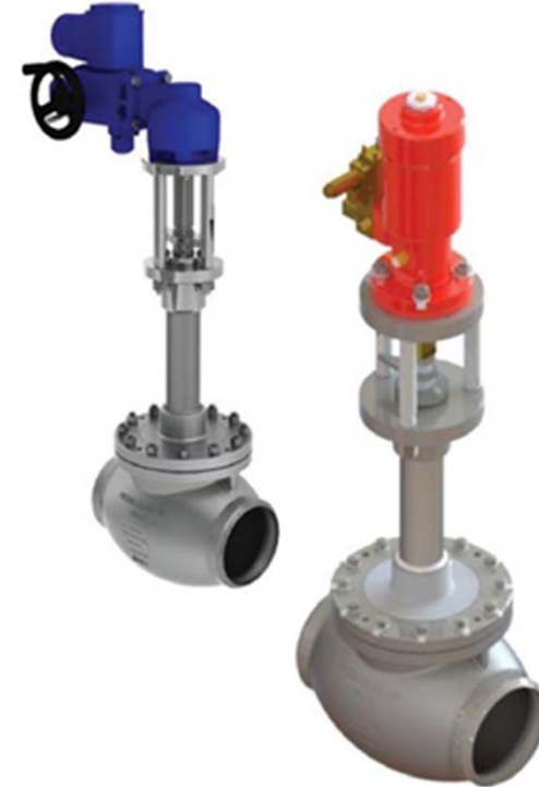
Cryogenic valves Bestobell