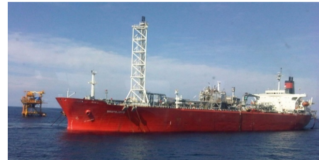
FPSO Brotojoyo at PUO field North Bali