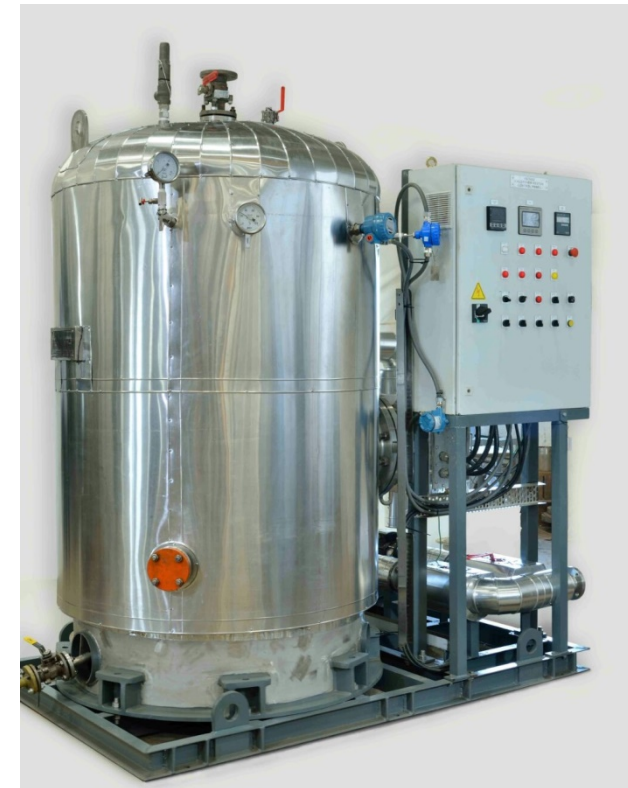
SS316L, 90 kw indirect heater, PLC based Control Panel Auto/Manual Operation