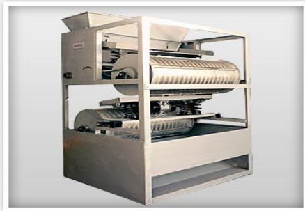
Double drum type magnetic separator

The screened material flows from vibrating screen that is the mixture of slag & metal contents goes to magnetic separator. Magnetic separator is most useful for non electric separating for separating iron from non magnetic product in bulk quantity for purity of end product, metal having commercial value. As the material feed from vibrating screen to magnetic separator, the powerful magnetic field attracts & hold iron particles from the revolving shell & slag contents falls freely from the shell, while iron particles are automatically discharged at the other end.