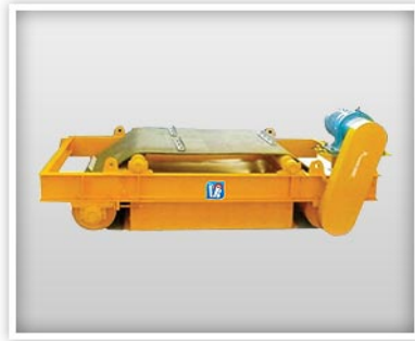
Permanent magnetic type suspended magnet Electromagnetic type suspended magnet

Over band magnetic separator is used between the belt conveyer from feeder to jaw crusher & jaw crusher to roller crusher. Over band magnetic separator plays the vital role in slag crushing plant. Over band magnetic separator collect the heavy metal contents from belt conveyer before feed to jaw crusher & roller crusher which improves the life to jaw crusher and roller crusher and reduce wear and tear of jaw crusher and roller crusher. Over band magnetic separator is also available in two models.