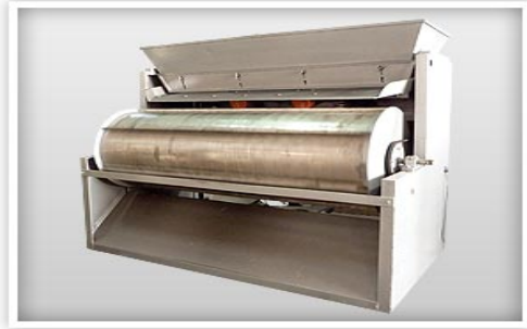
Single drum type magnetic separator