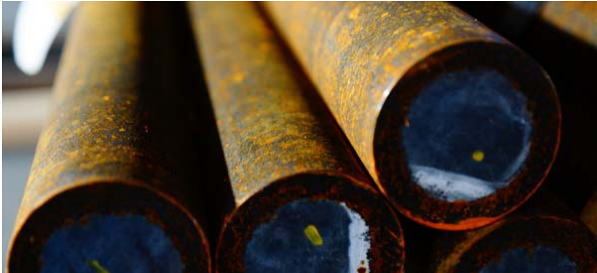
Hot rolled bar