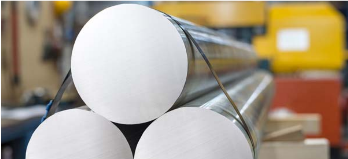
Bright turned bar