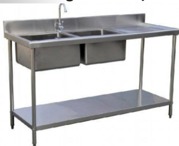
Two Sink Unit