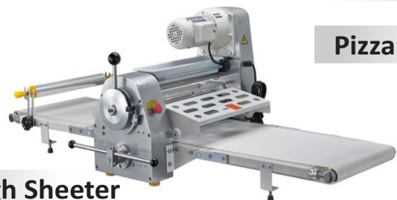
Dough Sheeter Table Top