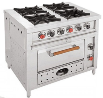
Four Burner Range with Pizza Oven