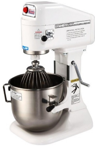
Planetary Mixer Capacity : 8 Liter