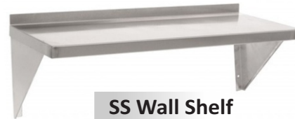
SS Wall Shelf