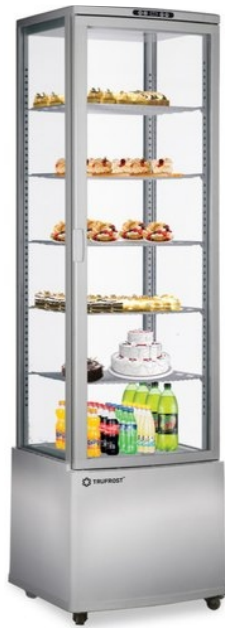
Vertical Cake Display