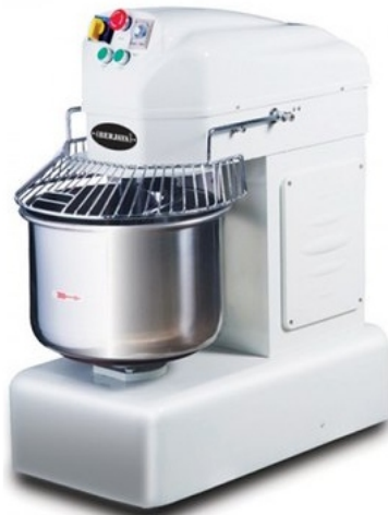
Spiral Mixer Capacity : 25 Liter