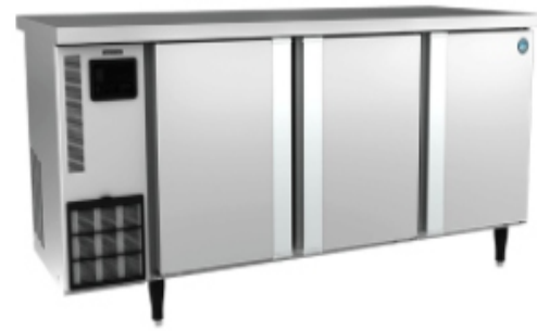
3 Door U/C Chiller / Freezer