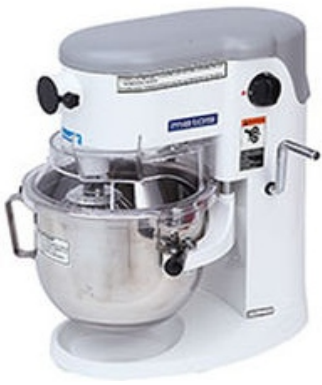
Planetary Mixer Capacity : 5 Liter