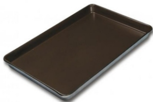
Baking Tray Non Stick