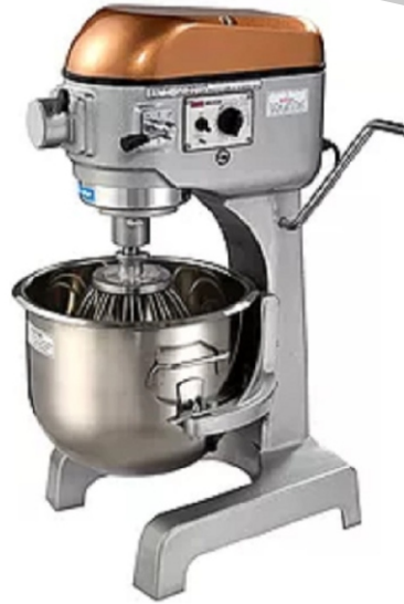
Planetary Mixer Capacity : 25 Liter