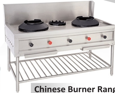
Chinese Burner Range