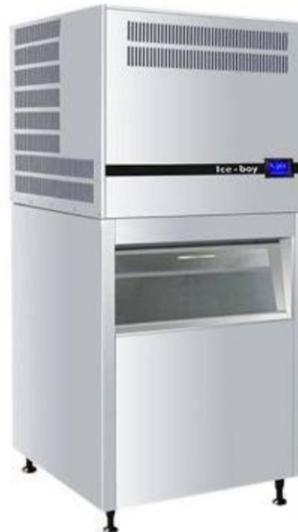
Ice Cube Machine