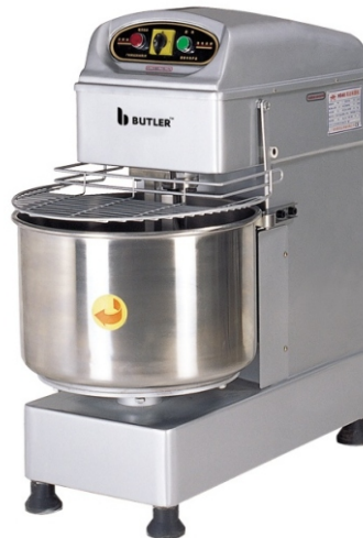
Spiral Mixer Capacity : 40 Liter