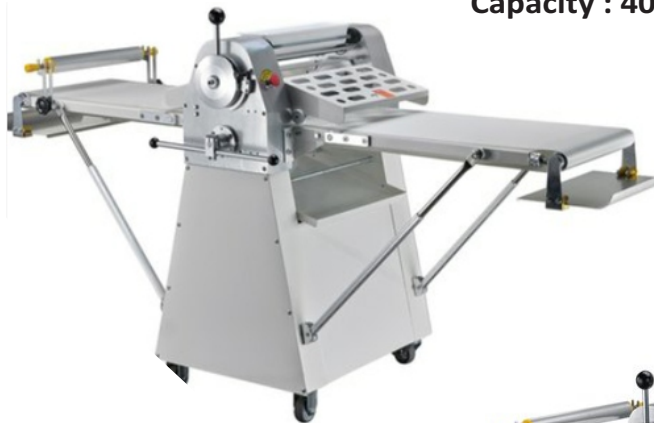
Dough Sheeter Floor Model