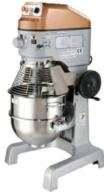
Planetary Mixer Capacity : 30 Liter