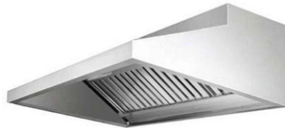
SS Kitchen Hood