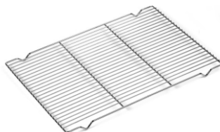
SS Cooling Tray