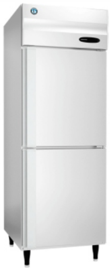
2 Door & 4 Door Chiller / Freezer