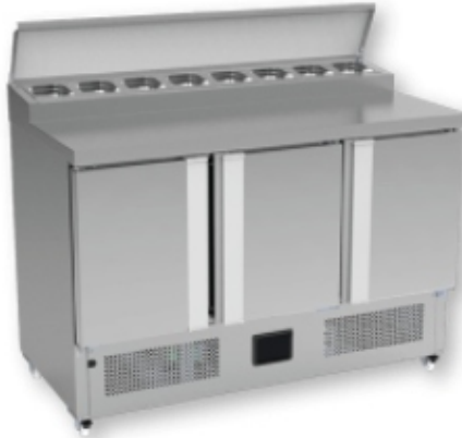
Pizza Preparation Counter