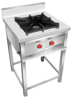
Single Burner Range