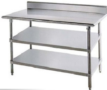
SS Working Table 2 U/S