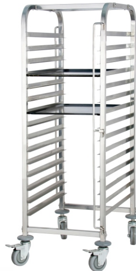
SS Cooling Rack Trolley