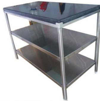
SS Working Marble Table 2 U/S