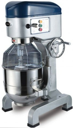
Planetary Mixer Capacity : 40 Liter