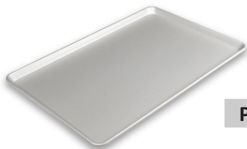
Baking Tray Allu Alloy