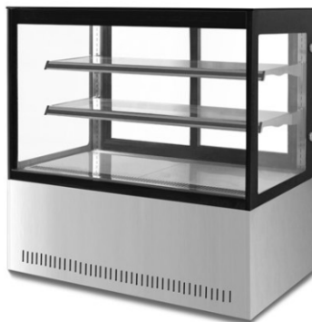
Cake Display Counter