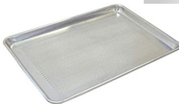
Perforated Tray Allu Alloy