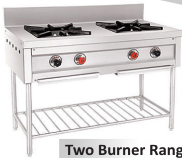
Two Burner Range