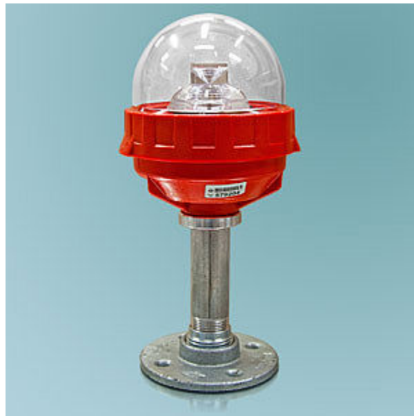
OBSTRUCTION LIGHTS SINGLE