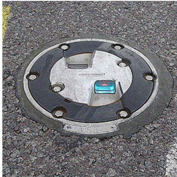
INSET RUNWAY- AND TAXIWAY LIGHTS