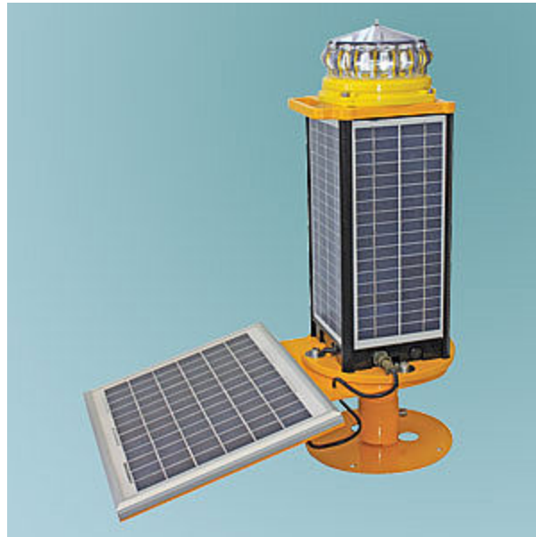
PORTABALE AIRFIELD LIGHTING SYSTEM