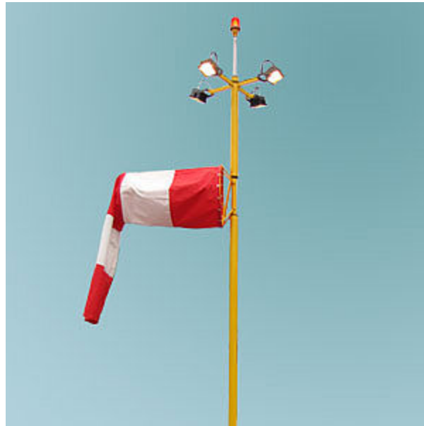
WIND DIRECTION INDICATOR