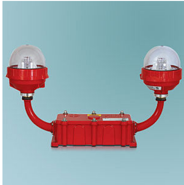
OBSTRUCTION LIGHTS DUAL