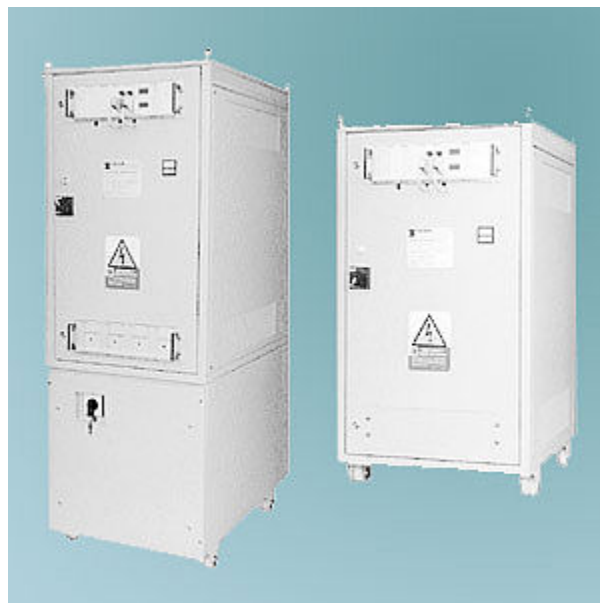
CONTROLS SYSTEM CCR WITH ACCESSORIES