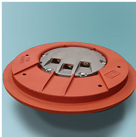
FULL FLUSH INSET LIGHTS