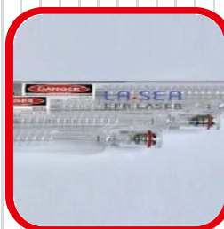
EFR Laser Tube