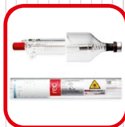
Reci Laser Tube