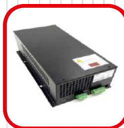
Power Supply Unit