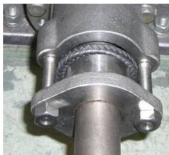
LABYRINTH SHAFT SEAL: