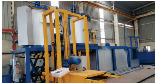
Bell Heat Treatment Plant