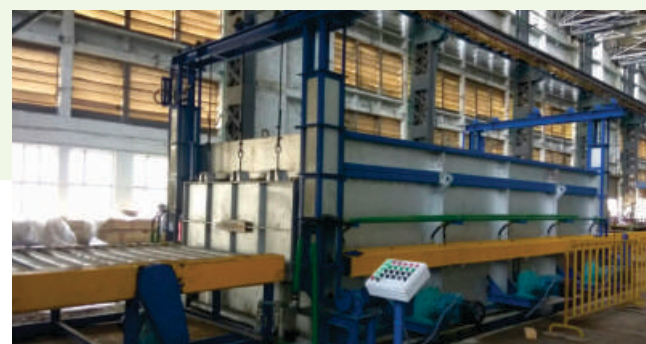
3MT/Hr Roller Hearth Re-Heating Furnace - 1150 C