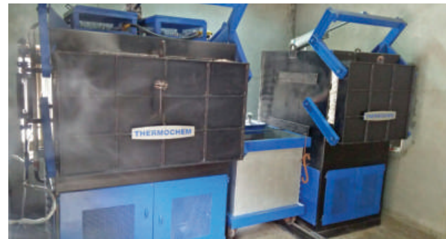
Box Type Hardening Tempering Furnace