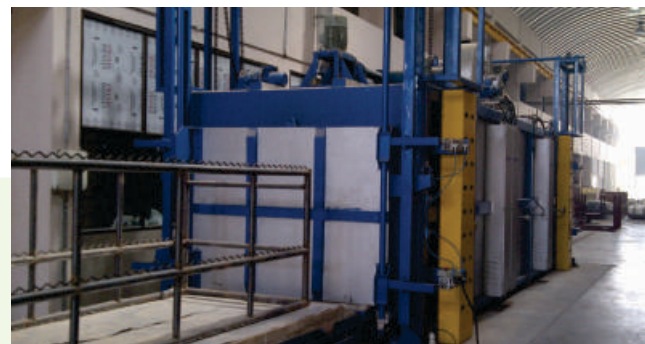
30MT Bogie Hearth Furnace

To drive excellence through team work and team spirit