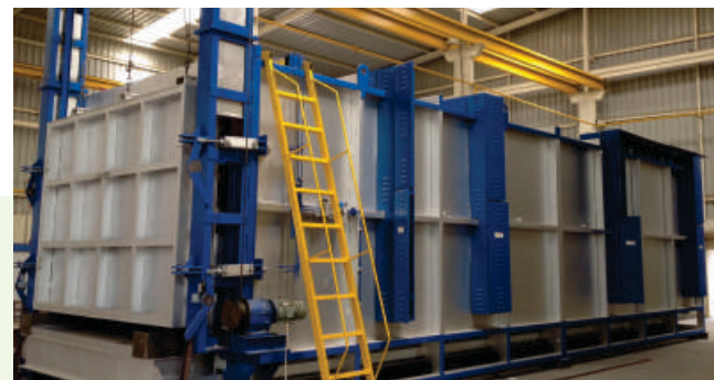
70 MT Bogie Hearth Furnace - 1100 C