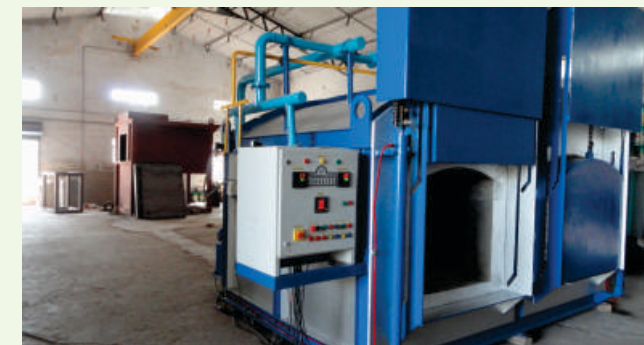
Shell becking Furnace