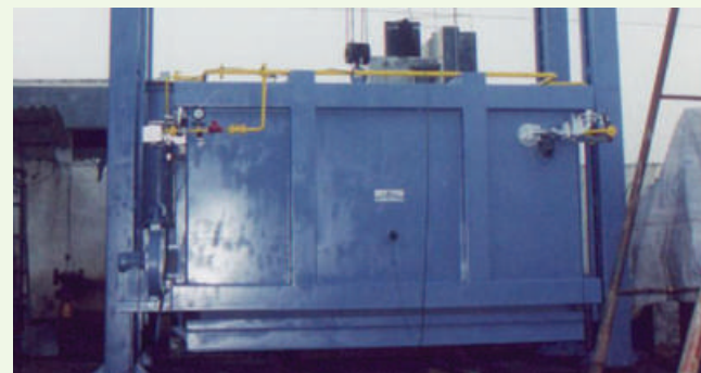
Gas Fired Car Bell Furnace