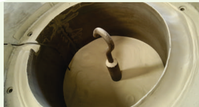
Fluidised Bed Furnace