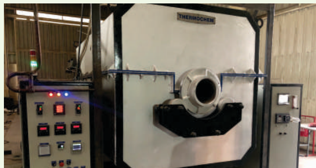
500 Kgs Rotary Retort Furnace