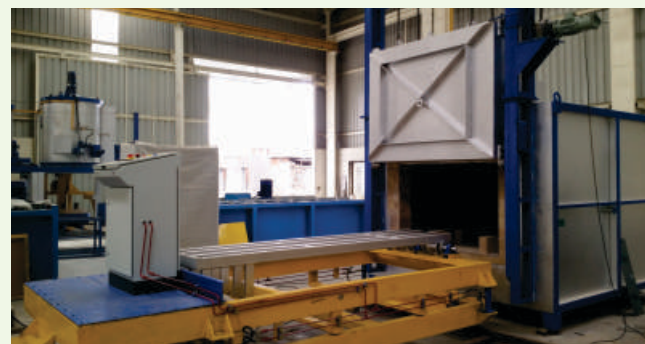
3MT Chamber Furnace with Charger