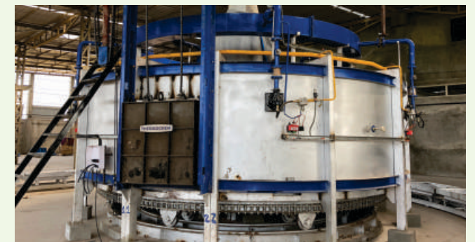
1MT/Hr Rotary Hearth Furnace - 1200 C