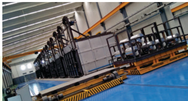
30MT Chamber Furnace with loading Charger - 600 C