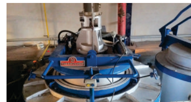
Pit Type Furnace