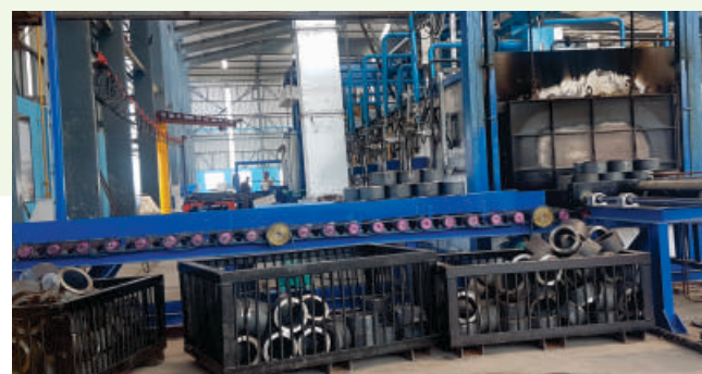
1200 Kgs/Hr Pusher Type NQT Furnace - 1100 C