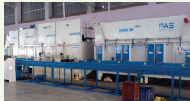
250 Kgs/Hr Continuous Heat Treatment Furnace - 950 C