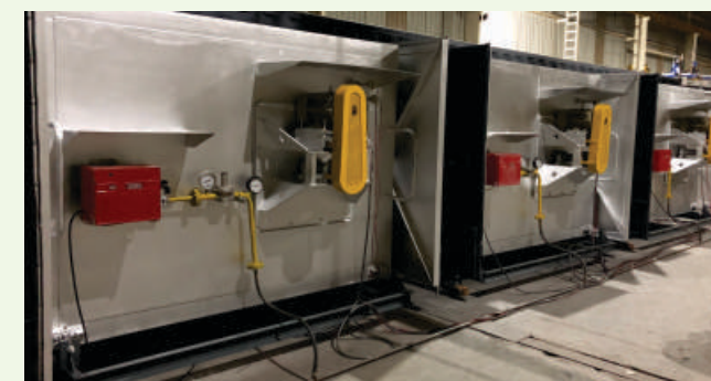
3MT Container Mobile Oven