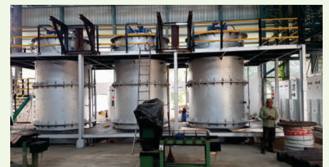
9MT Pit Type Heat Treatment Furnace - 950 C