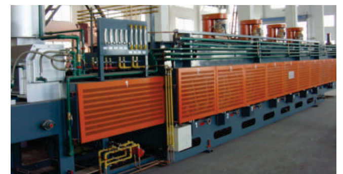
Mesh Belt Furnace