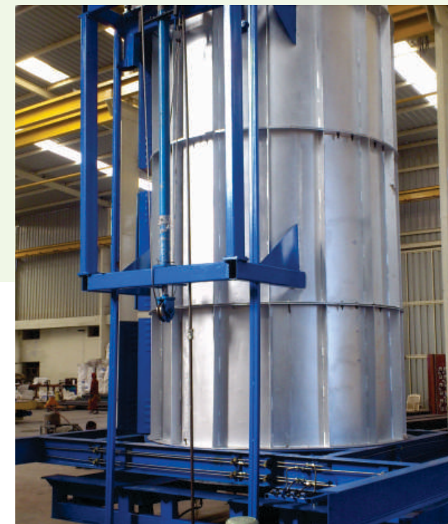
3 MT Drop Bottom Furnace - 550 C